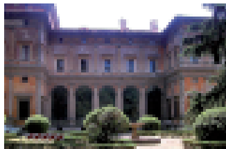
ACCADEMIA DEI LINCEI PALAZZO CORSINI Via della Lungara 10, Roma